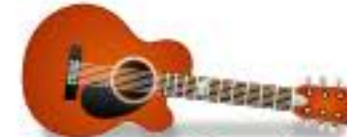
Example Product line 2 of description Price: £325.99