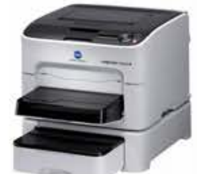
KONICA MINOLTA 1650END COLOUR LASER PRINTER