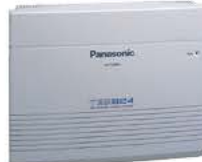
PANASONIC KXT 3-08 CENTRAL CONTROL UNIT