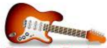
Example Product line 2 of description Price: £325.99