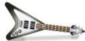
Example Product line 2 of description Price: £325.99