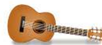
Example Product line 2 of description Price: £325.99