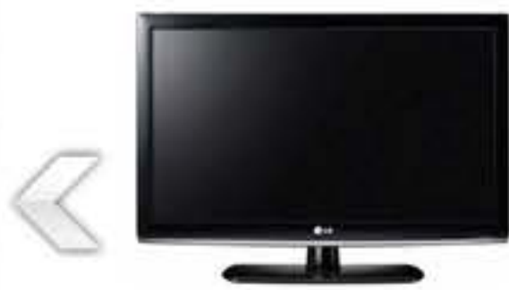
LG 22LD350 LCD TELEVISION