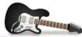
Example Product line 2 of description Price: £325.99