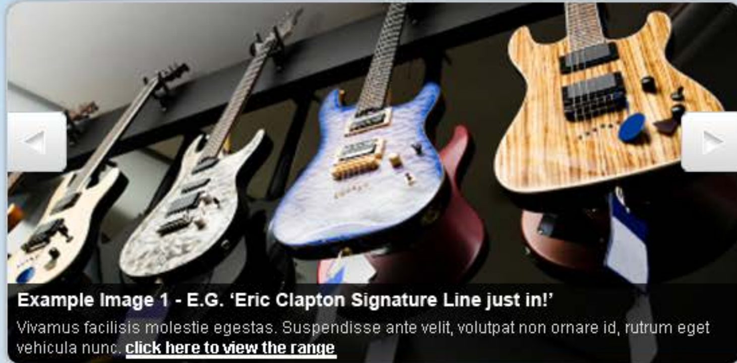
Example Image 1 - E.G. 'Eric Clapton Signature Line just in!' Vivamus facilisis molestie egestas. Suspendisse ante velit, volutpat non ornare id, rutrum eget vehicula nunc. click here to view the range