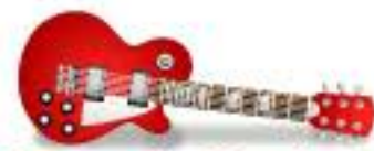
Example Product line 2 of description Price: £325.99