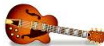
Example Product line 2 of description Price: £325.99