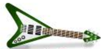
Example Product line 2 of description Price: £325.99