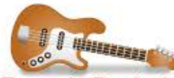
Example Product line 2 of description Price: £325.99